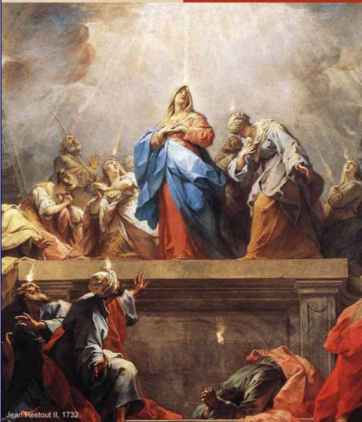
Jean Restout II, 1732

Bulletin articles are due on Monday morning Reconciliation: Saturday 4:00 P.M. and by appointment Weddings by appointment, please notify Pastor at least four months prior Baptism every month - Call Parish Office New Family Registrations - Call Parish Office